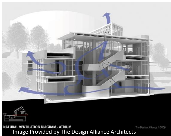
Figure 2 – Building section explaining the natural ventilation of the passively designed atrium.