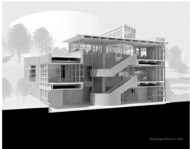
Figure 4 - Cross Section of Atrium. Image provided by Alliance Architects

Breadth 2 will also be performed on the design of the atrium stair previously discussed in Breadth 1. The stair is located in the main atrium of the building and greets guests from both the roof terrace (connected to the neighboring building) and the main entrance to the facility. The two story stair will be redesigned in a Caesar style that will match the overall motif to the building. The current stair is depicted in Figure 4. A change order has since removed the column extending from the second landing to the roof.