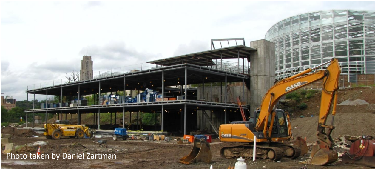
Figure 3 - Concrete and steel superstructure taken September 7, 2011.

Aside from weather, there are few externalities affecting work on this project. Site access and size are suitable for the scale of the building footprint and project. The site that the project inhabits was almost vacant, and thus no phased or dual occupancy requirements are needed. Minor inconveniences include the relocation of a few select utilities and the demolition of a small portion of an existing small onsite warehouse.